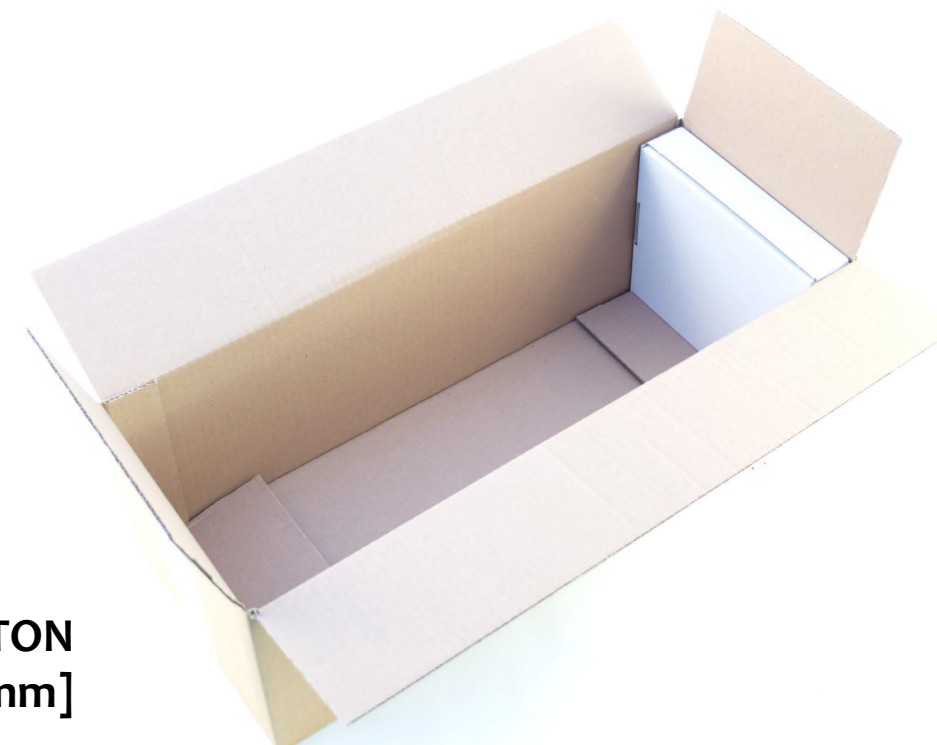
MASTER CARTON [494x195x161mm]