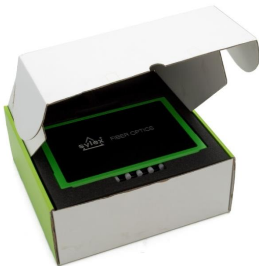
Figure 1: Cardboard box as standard packaging