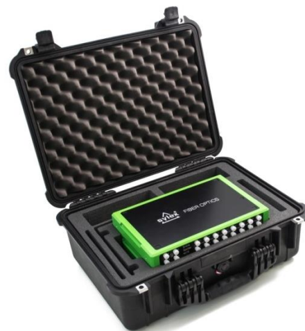
Figure 2: Waterproof, crash proof and dust proof transportation case as optional packaging

For more information contact our sales team at sales@sylex.sk